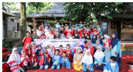
Figure 10. Group Photo of Sekolah Alam Robbani Students and Teachers

The school also feels very happy and satisfied with this activity, because it provides a new understanding for its students and indirectly provides an independent attitude to students to be able to practice directly from the results of this activity. And the school feels that this activity is very positive and should be carried out sustainably in the future.