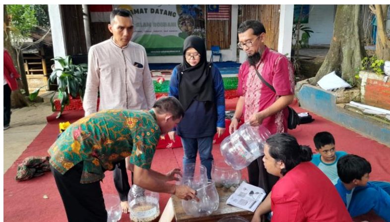
Figure 4. Use of used mineral water gallons as a compost bin

Hands-on pre-skilled students in the implementation of 4 composting tips.