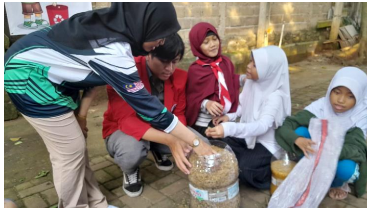
Figure 5. Making Media for Compost

Students participated in this activity with great enthusiasm and there was very good interaction between the speakers and students, and it is hoped that this program will run smoothly and provide a good understanding to Sekolah Alam Robbani students.