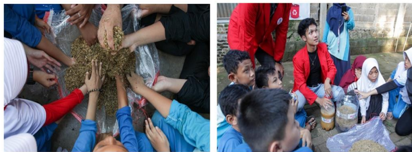
Figure 9. Group Division for Direct Composting

From the results of the evaluation of this activity, the division of small groups in the direct practice of composting was very effective. Students can easily understand and master this waste management and processing technique, so they are encouraged to make and practice it directly at their respective homes.