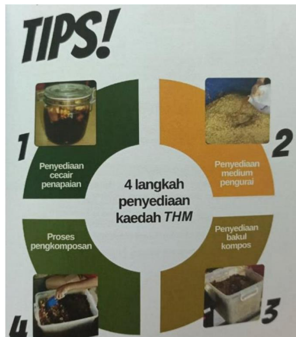
Figure 3. Tips for the 4-step Takakura Home Method

Hands-on pre-skilled students in the implementation of 4 composting tips.