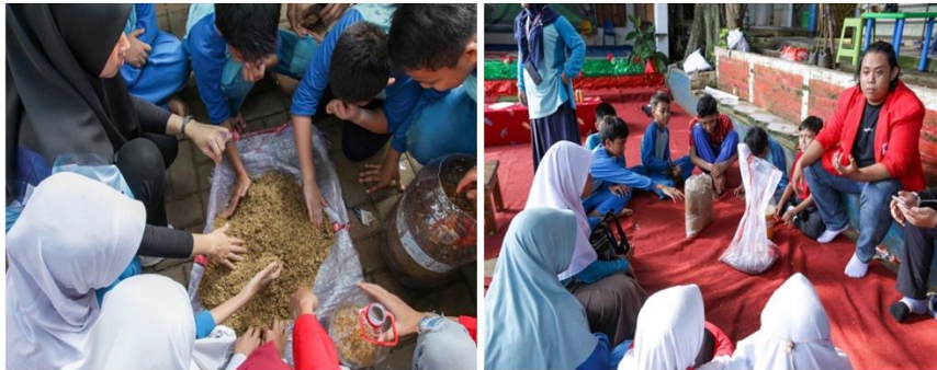
Figure 8. Small Group Division for Activity Evaluation

method in accordance with the theory and practice that had been given previously.