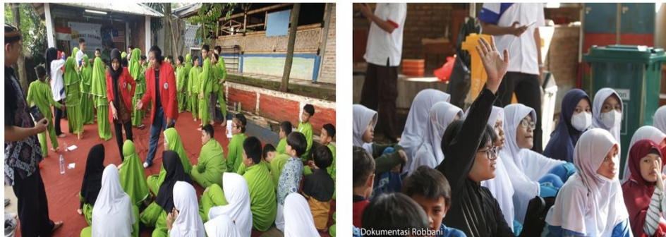
Figure 6. Good Interaction between Presenters and Students

Students participated in this activity with great enthusiasm and there was very good interaction between the speakers and students, and it is hoped that this program will run smoothly and provide a good understanding to Sekolah Alam Robbani students.