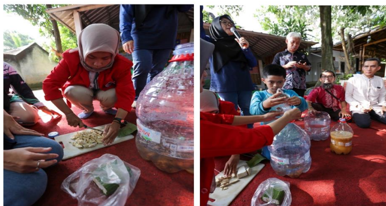
Figure 7. Hands-on practice of Takakura Home Composting Method

The evaluation technique used is to divide students into 5 groups accompanied by students to carry out direct composting with materials and materials that have been prepared by the implementers of community service activities. In these small groups, they made compost using the Takakura Home