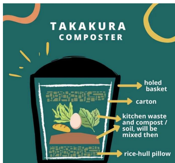
Figure 2: Takakura Home Method Composting Technique

The activity began by providing theoretical material on the procedures for processing and making compost using the Takakura Home Method Composting Technique (Jiménez-Antillón et al., 2018).