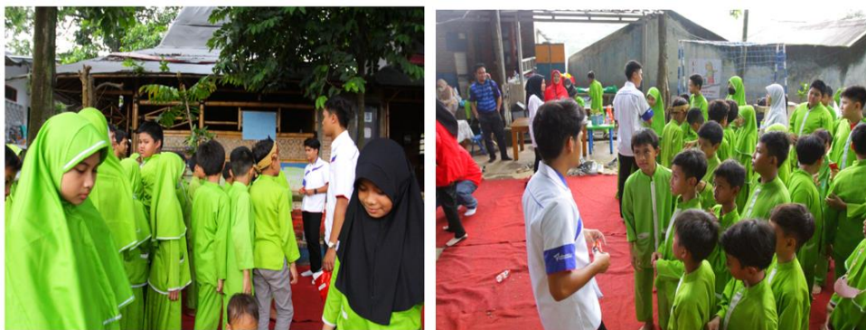
Figure 7. Giving material by UTHM students

In this activity a discussion and evaluation of the results of the socialization was also given, where at the end of the activity students were asked questions about the material that had been submitted as evaluation material for the implementing team. The evaluation technique used is to divide students into 5 groups assisted by students to practice directly with materials and materials that have been prepared by executors of community service activities. In these small groups they are given media quizzes in accordance with the theory and practice that has been given before.