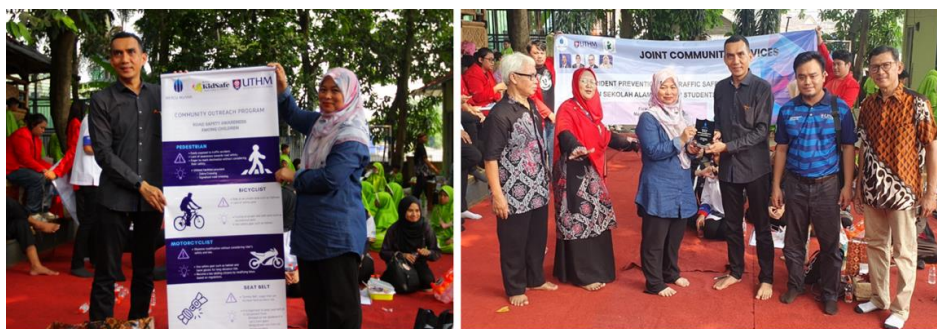
Figure 10. Bunting for KidSafe Banner Handover