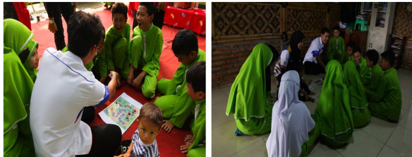
Figure 9. Group Division for Direct Composting

From the evaluation results of this activity, the division of small groups in hands-on practice of understanding traffic signs is very effective. Students can easily understand the instructions of traffic signs, and facilities for pedestrians.