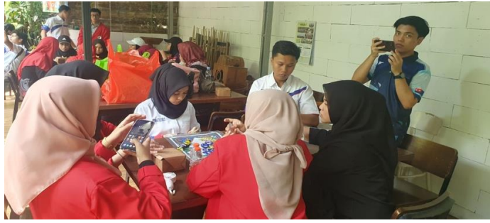
Figure 5. Make a traffic sign display