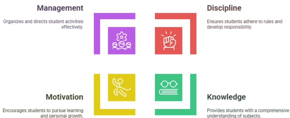
Figure 2. Cultivating Disciplined, Knowledgeable And Motivated Students Through Effective Management

In addition, it also implements the IQAB system, which is a punishment or sanction given to students who do not meet the established discipline standards. The main purpose of this system is to educate students about the importance of responsibility, discipline, and respect for applicable rules. Wali Ma'had uses this system wisely to improve the discipline of their students.