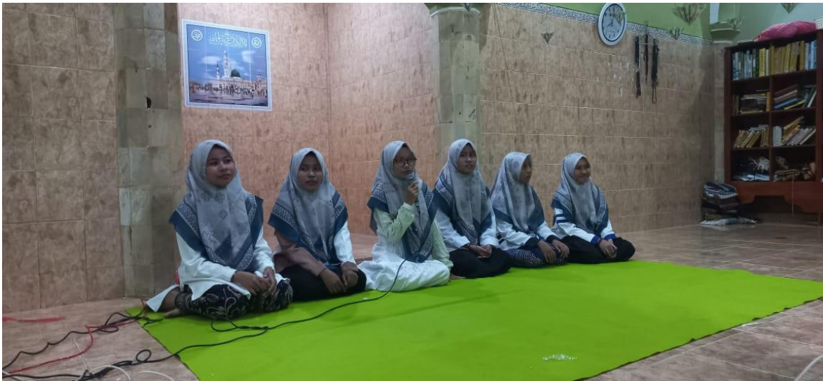
Figure 1. Documentation of the implementation of Jam'iyatul Muballighah

The consistent implementation of Jami'atul Muballighah despite facing challenges shows a strong commitment from the management and students. This dynamic reflects the importance of adaptive and responsive activity management to the needs of students. This activity successfully integrates the spiritual dimension into the routine of the pesantren, which supports the theory of the importance of balance between academic education and spiritual development in a holistic education system.