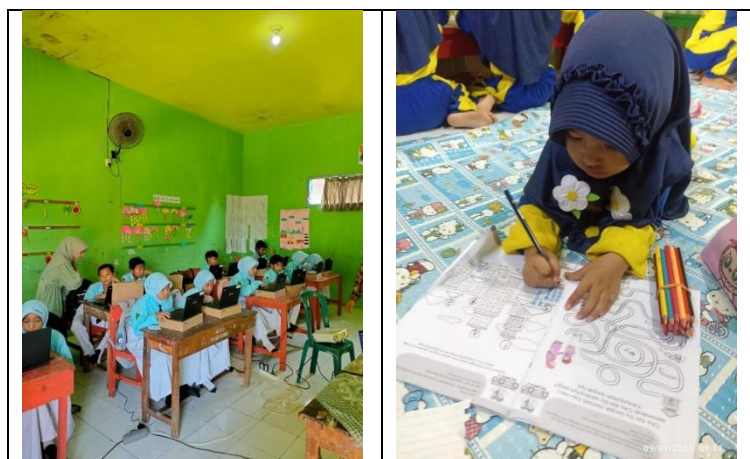
Figure 1. The use Technological Tools in Learning Students Work on Assignments Individually

Interviews with teachers and students confirmed that implementing classroom action research (PTK) with a more contextual and Islamic value-based approach can increase student engagement in learning. This higher engagement is not only limited to understanding the material but also includes aspects of attitudes and characters that are more in line with the demands of Islamic education. By providing space for students to participate and relate learning materials to their daily experiences actively, education can be more effective in developing students’ character and knowledge simultaneously.