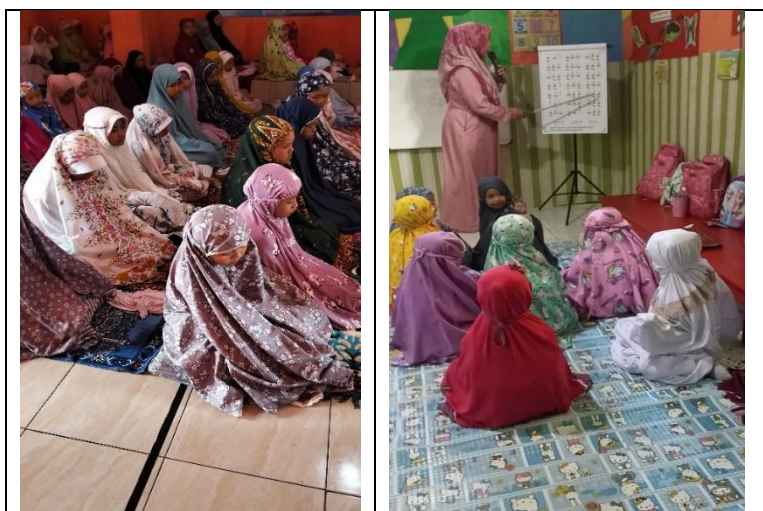
Figure 3. The students are Performing the Dhuha Prayer and RA Darus Salam is learning Iqro'

In addition, students at MI Darus Salam expressed that they felt happy when Islamic values were applied in daily lessons. One student stated, "I feel more motivated to learn and behave well when taught Islamic values that are by the lessons they receive." This indicates that the application of Islamic values in learning can increase student motivation and engagement, as well as help them in forming good morals.