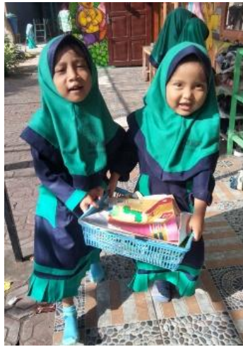
Figure 1. Children Bring Reading Books Before Activities

The children were very enthusiastic in the "One Day One Story" activity, they were happy to help the teacher in picking up and putting away reading books. The story books used consist of picture books, making it easier for children to understand the content of the story. This picture book motivates them to learn more because of the attractive visuals and easy-to-follow story. With good picture books, children are helped in the process of understanding and enriching the experience of stories. They can connect pictures with words, which makes the reading process more fun and effective.