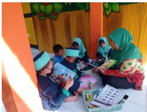
Figure 2. Reading Fairy Tales Together

Agree with this, the method of telling stories with pictures is very effective for teachers to use in an effort to increase interest in learning in young children. From this explanation, it can be understood that the teacher's role in using the fairy tale method is very important to trigger children's interest in reading. In the "One Day One Story" activity, the teacher uses the technique of reading together and retelling the content of the reading in the book. In this way, children not only engage in reading activities, but also learn to understand and interpret the stories they read, and develop their communication skills. These activities not only increase children's interest in reading, but also help them develop social and cognitive skills that are important for their future. Support from community reading parks and teachers' active role in teaching and storytelling is a strong combination to create a holistic and enjoyable learning environment for children, so that the long-term goal of creating a high-quality and broad-minded next generation can be achieved.