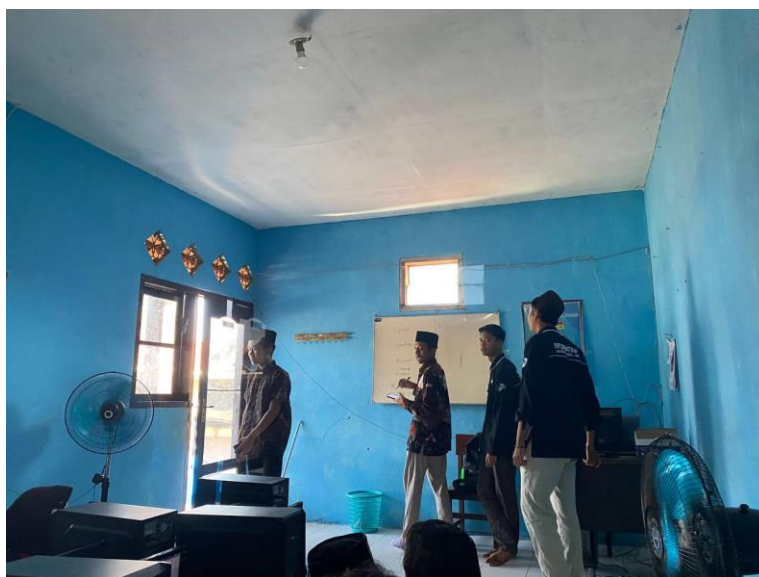
Fig. 3. Recording of goods to be transferred

By using QR Code, the process of tracking the mutation of goods becomes easier and more transparent. Every mutation of goods can be recorded and tracked in real-time through QR Code scanning, allowing schools to monitor the movement of goods more effectively. This also makes it easier to prepare reports on the status and location of goods, which was previously difficult to do with a manual system.