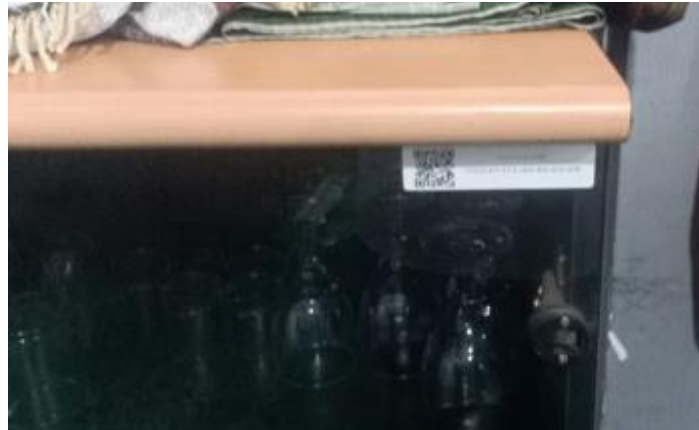
Fig. 1. Labeling goods with QR Code

implementation of this system has succeeded in reducing data recording errors and increasing the efficiency of the inventory process.