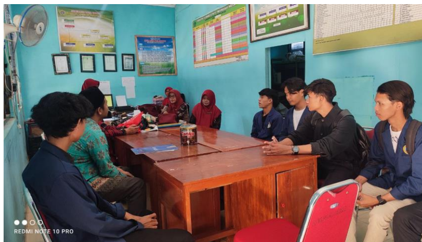
Fig. 4. Madrasah Staff Training with TEAM

Intensive training was given to the administrative staff of MTs Mambaul Hasan to ensure that they were able to operate the QR Code system properly. The training materials included how to use the QR Code application to enter goods data, track mutations, and generate reports. The results of this training showed a significant increase in the technological skills of the staff, who are now more competent in managing school assets using the new system.