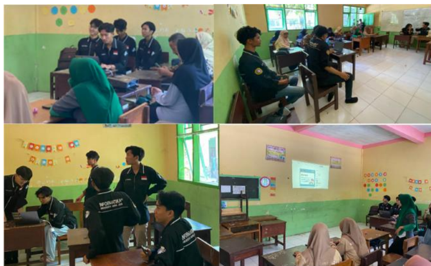
Fig. 2. Training Implementation

The teacher training on the use of artificial intelligence (AI) technology at State Elementary School 12 was carried out in several stages aimed at improving teachers' skills in classroom management and student evaluation. The process began with a needs analysis to understand the specific challenges and requirements of the teachers. Afterward, the service team designed a training module that included workshops, practical sessions, and technical guidance. The two-day workshop provided a basic understanding of AI, including its application in student data analysis and classroom management. Practical sessions allowed teachers to directly practice using relevant AI tools and applications, with step-by-step guidance and necessary devices. After the training, ongoing technical guidance was provided to ensure effective implementation of AI technology in the teaching process.