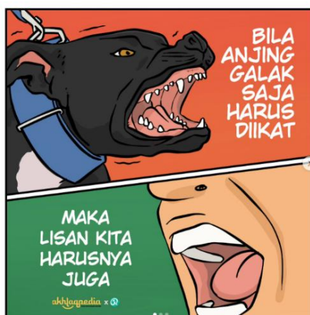
Figure 1. Illustration

The following illustration content uploaded by the @Akhlaqpedia account was selected purposively based on its relevance to the theme of morals and Islamic values, such as honesty, patience, and manners.