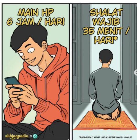
Figure 2. Illustration

"O Ali, Allah has not created in humans anything that is more important than words. With words a person will go to heaven, and because of words someone can also go to hell. So bind your words, because words are like fierce dogs."