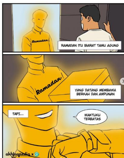
Figure 3. Illustration Source3. Posts from the @akhlaqpedia account

determined for believers. (QS An-Nisa' · Verse 103)