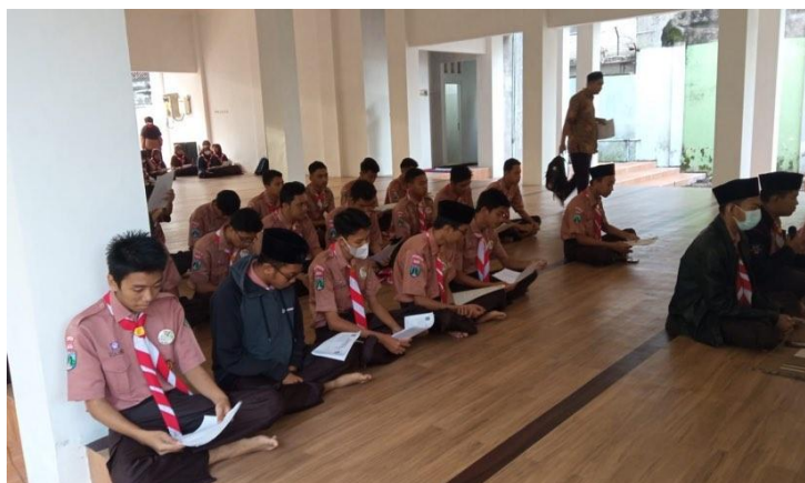
Figure 1. Istighosah activities carried out by Mosque Youth (REMAS)

Listening to the findings of this study, it can be seen that the sustainability of Remas activities cannot be separated from the active role of PAI teachers who are present not only as supervisors, but as facilitators who accompany each process. The involvement includes mentoring from the activity planning stage to implementation, so that students feel a clear direction as well as an opportunity to participate. This strategic pattern can be seen in three main aspects, namely the continuity of religious activities such as routine istighosah, the involvement of teachers in accompanying the program, and the establishment of open communication between teachers and students. These three aspects synergistically create an atmosphere conducive to the gradual and structured internalization of religious values. From the perspective of education public relations management, this pattern shows that the development of religious character in schools becomes more effective if there is a consistent, active supervisor, and provides a collaborative space for students to develop their religious potential.